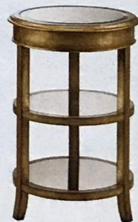
COAST TO COAST ACCENT TABLE $340; atgstores.com.